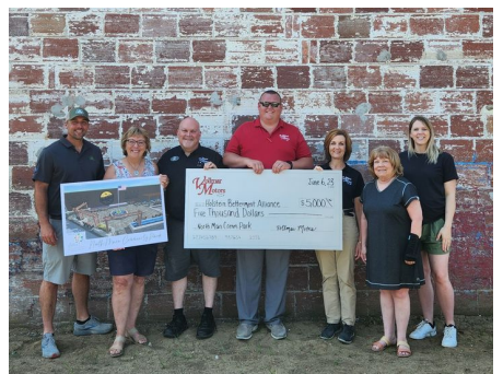
Vollmar Motors presenting a $5,000 donation to HBA Board members