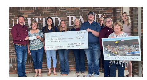
UBI - Holstein presenting a $10,000 donation to HBA Board members